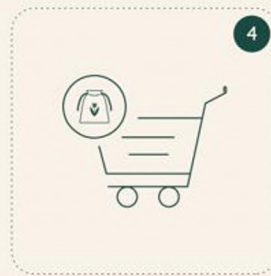
Place an order