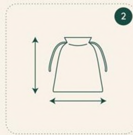
Pick an ideal dimension