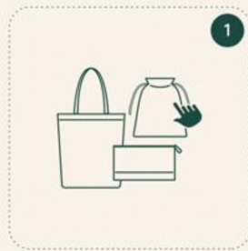
Choose a product