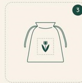
Share your design