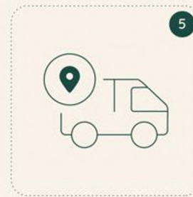
Get hassle free door delivery