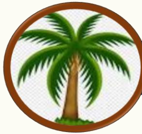
Date Palm Leaf