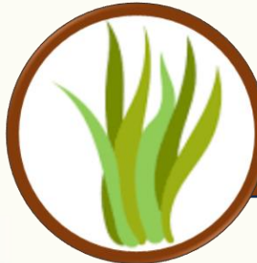
Sea Grass /Sabai