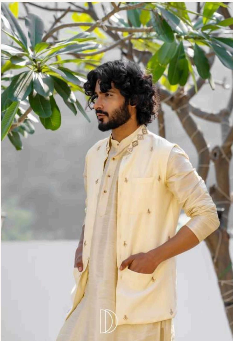
HAND EMBROIDERED BANDGALA WAISTCOAT