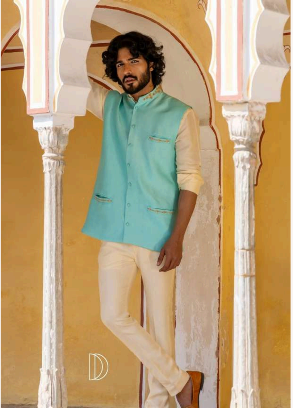
MINIMAL HAND EMBROIDERED BANDGALA WAISTCOAT