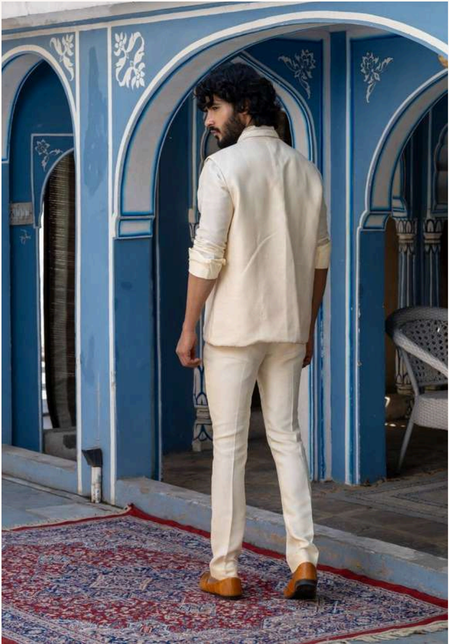
HAND EMBROIDERED ASYMMETRICAL WAISTCOAT