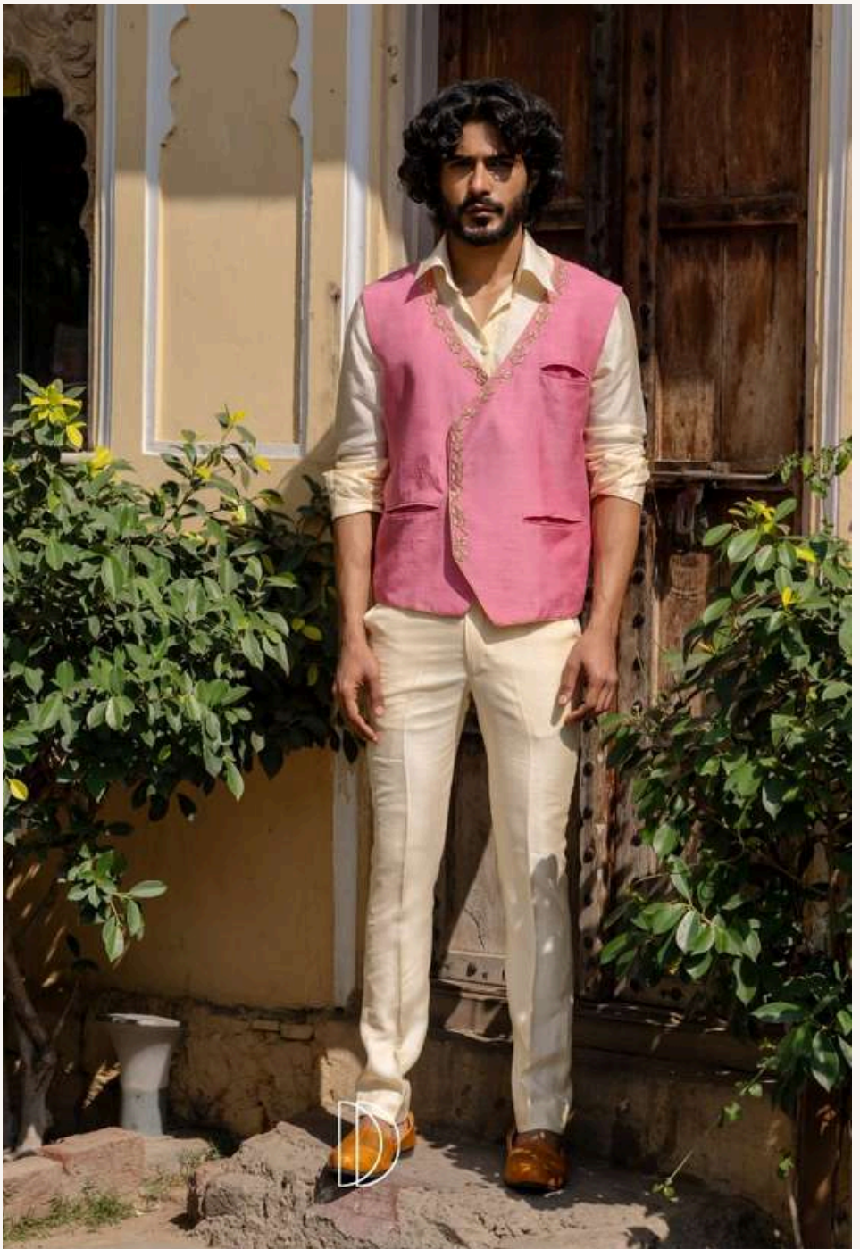
V-NECKLINE HAND EMBROIDERED WAISTCOAT