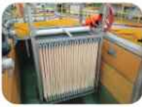
Membrane Bio Reactor

Water content free waste is a need. Through our system we offer water free waste.