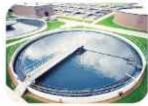
Sewage Treatment Plant